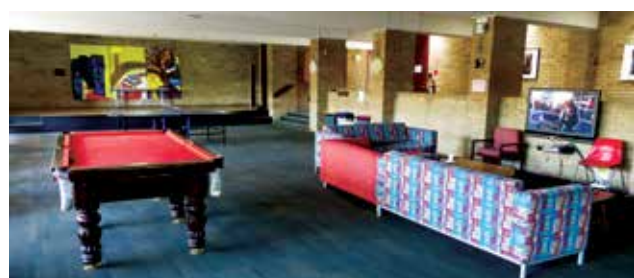
The Common Room is now a funky space for students to gather and unwind