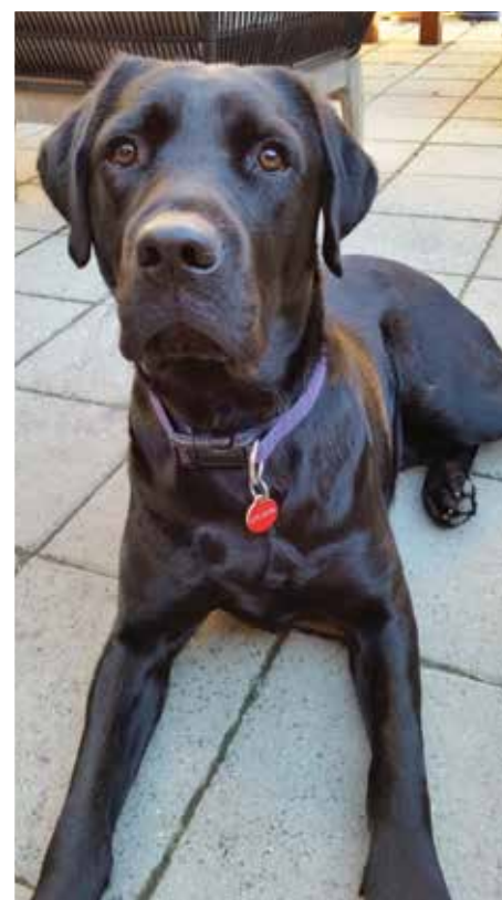
Vossy aka Rainbow, a special companion

What a wonderful outcome for Vossy... ah, Rainbow... and his family!