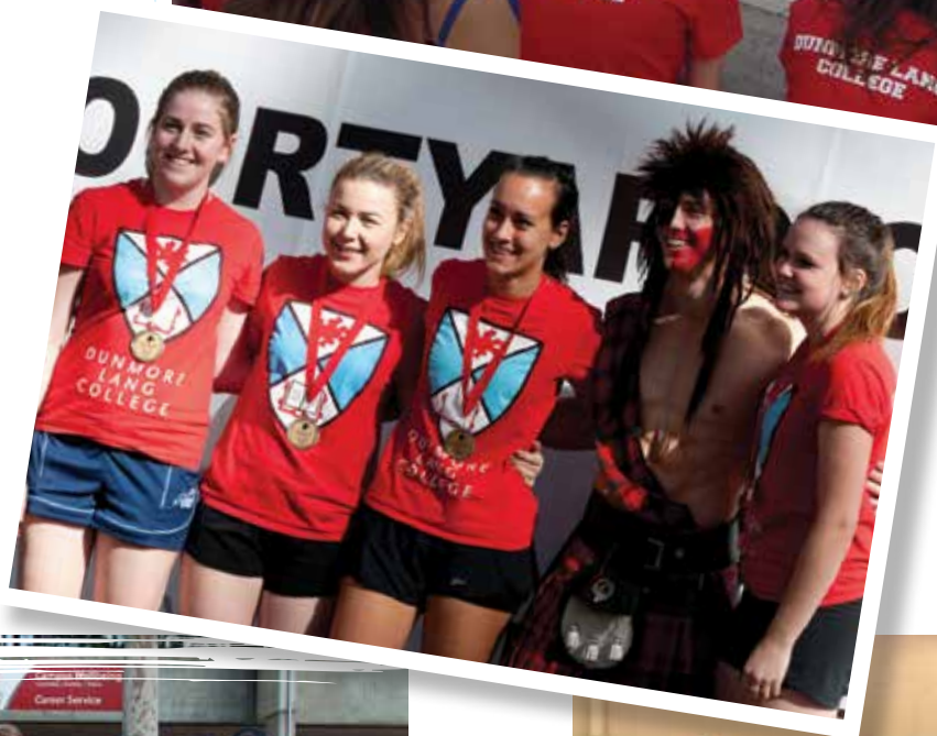
The girls' team won the Courtyard Challenge relay