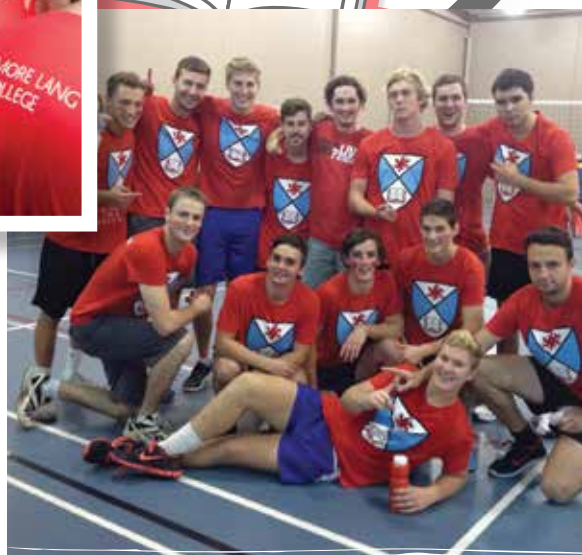
The boys' volleyball team