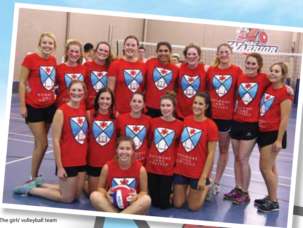
The girls' volleyball team

In netball DLC dominated the court winning all of our games. Outstanding team work was key to our success as we showed RMC and MUV how it's done. In the first game our girls set the standard with a 19-1 demolition of MUV. They then backed it up with a 10-3 win over RMC. The boys were equally as impressive with their 9-4 win over the Village, and 19-6 win over RMC.