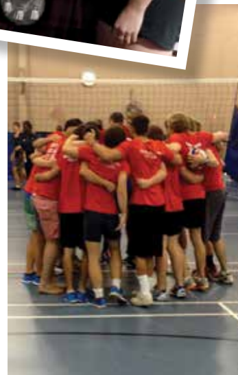
Runners in the Courtyard Challenge with their supporters